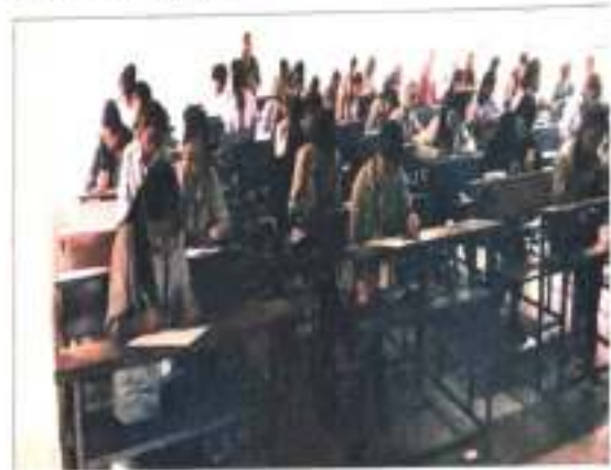
Students Participation Theory Examination