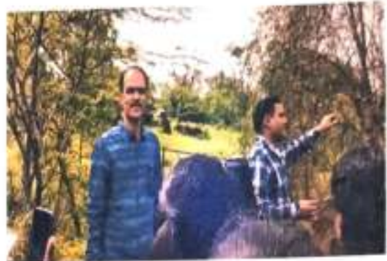
Students visited to observe medicinal plants